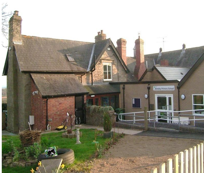
Almeley Primary School

IF YOU NEED FURTHER INFORMATION OR ASSISTANCE IN COMPLETING THE QUESTIONNAIRE, PLEASE CONTACT THE PARISH COUNCIL OR MEMBERS OF THE STEERING GROUP.